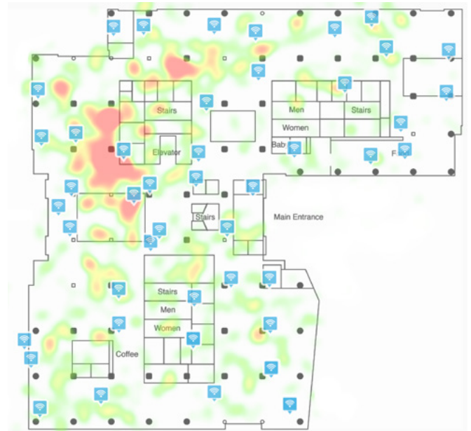
Rich analytics show detailed foot traffic patterns in a physical space.